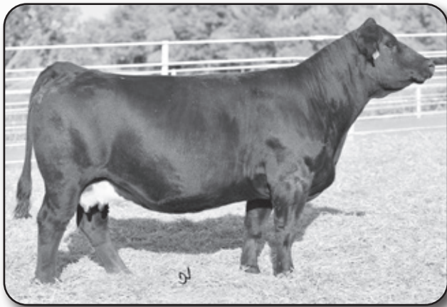
TJ 22X Donor dam of Lots 53-55