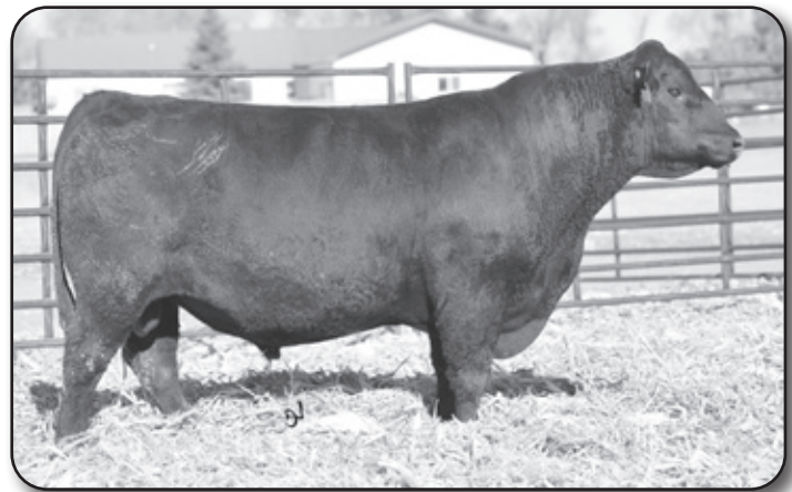
EGL Aviator E7136 Sire of Lot 24