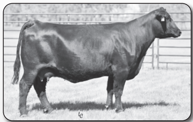
AHL Deb 467B Grandam of Lots 40-45