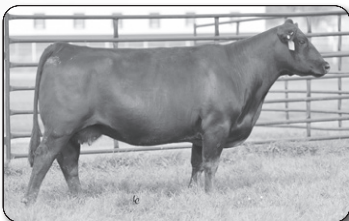
EGL Alexandra C428 Dam of Lot 25