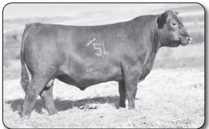
5L Like a Boss 8986-283F Sire of Lots 76-77