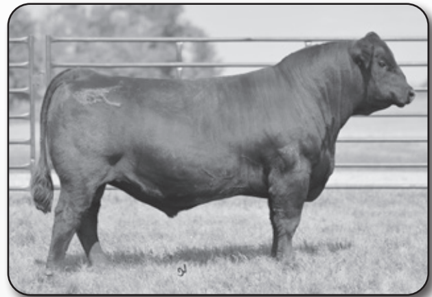
EGL Glacier 48G Full brother of Lot 55