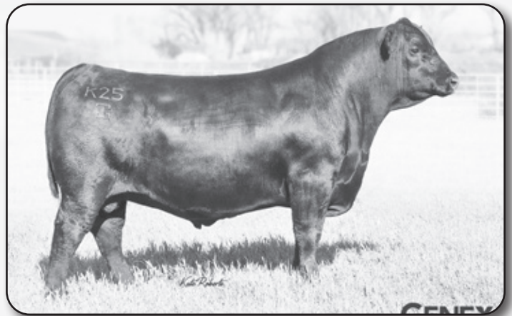
G A R Ashland Sire of Lots 22-23