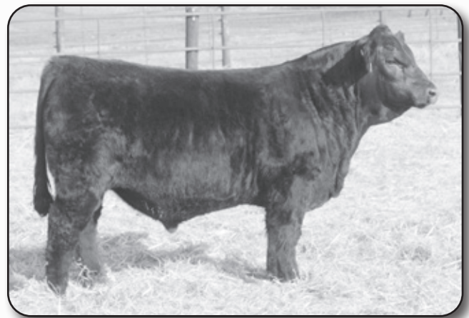
WB Objective E105 Sire of Lots 61-65