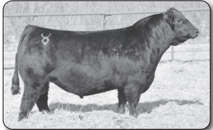
EGL Firesteel 103F Full brother to the dam of Lot 48