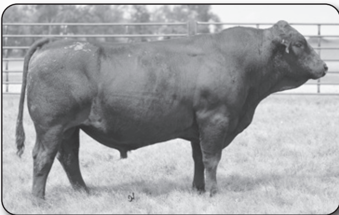
DCH Big Andy D672 Sire of Lots 34-35