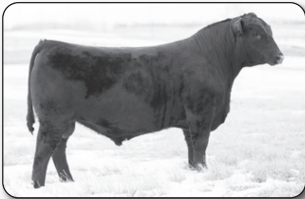
Hook's Encore 65E Sire of Lot 52

51 EGL HEADLINE 088H BD: 2/27/20 ASA: 3719292 Tattoo: 088H Homo Black 1/2 SM 1/2 AN Homo Polled