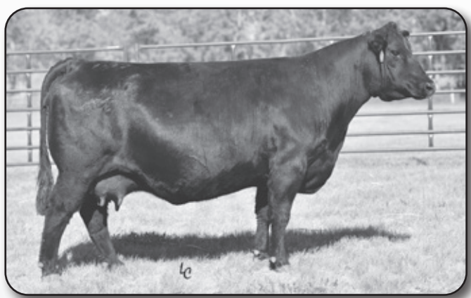
EGL Evelynn U426 Grandam of Lots 46