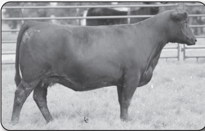
EGL Piper Ann E148 Dam of Lot 18