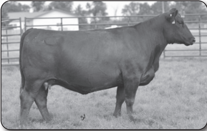
EGL Destiny E379 Dam of Lot 80