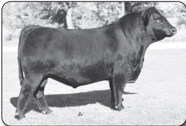
EGL Roundhouse B019 Sire of Lot 28 and Paternal Grandsire of Lots 29-32

28 EGL HACKSAW H553 BD: 5/22/20 ASA: 3745936 Tattoo: H553 Homo Black 5/8 GV 3/8 AN Homo Polled